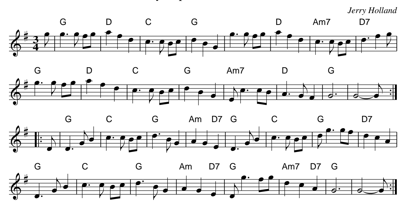
SPUDs Tune Swap #29 - Family & Home - June 10, 2021